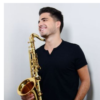
Chart eight times and has had 20 songs on the Billboard Top 10. His fun-loving stage presence and his obvious passion for playing elevate the audience to an exciting frenzy.